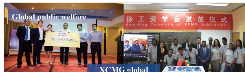
XCMG global scholarships