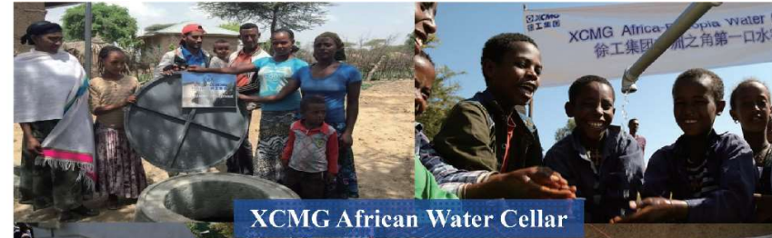
XCMG African Water Celler