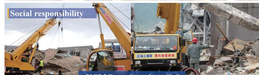
XCMG earthquake relief